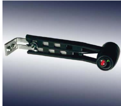
LED Status Description